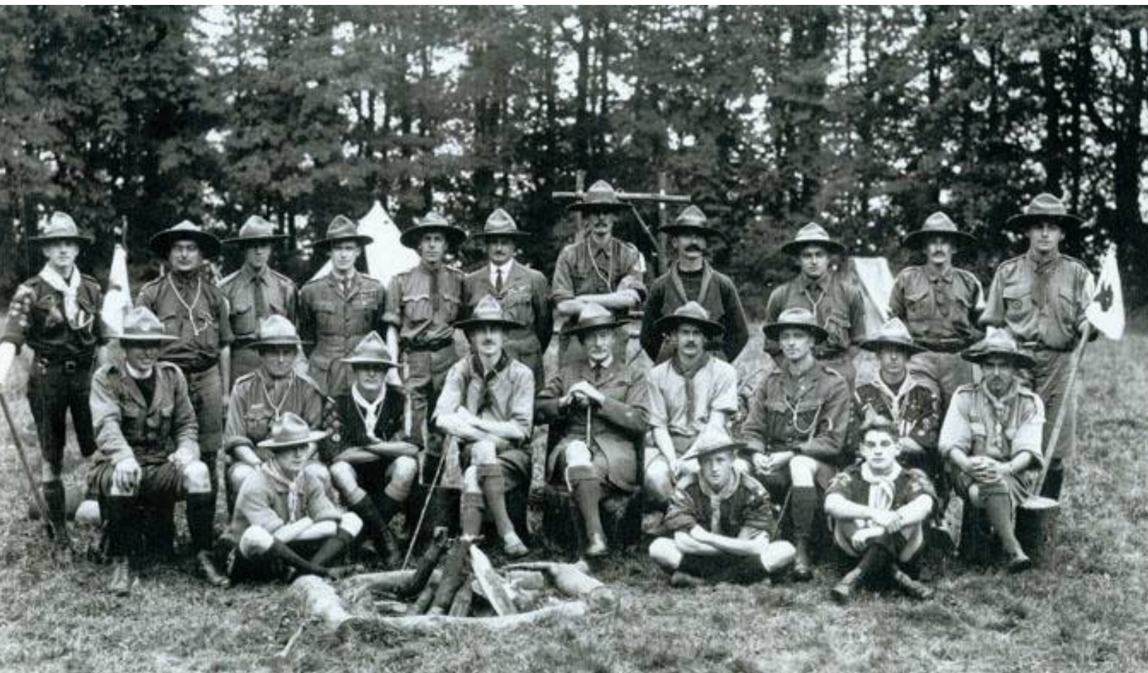
First Wood Badge Course, Gilwell Park, September 1919

True leadership takes many forms and there IS a leadership bone in everybody.